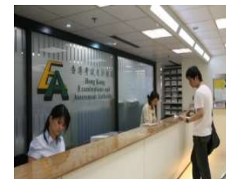
#KEAA 12/F, Southorn Centre